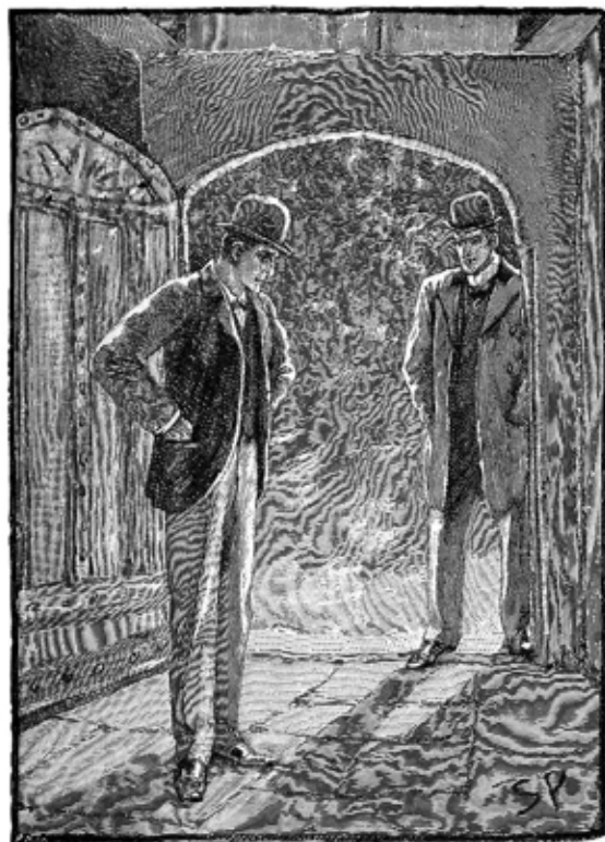
"THIS WAS THE PLACE INDICATED."

setting sun shone full upon the passage floor, and I could see that the old foot-worn grey stones, with which it was paved, were firmly cemented together, and had certainly not been moved for many a long year. Brunton had not been at work here. I tapped upon the floor, but it sounded the same all over, and there was no sign of any crack or crevice. But fortunately, Musgrave, who had begun to appreciate the meaning of my proceedings, and who was now as excited as myself, took out his manuscript to check my calculations.