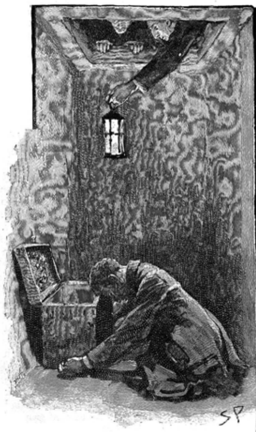
"IT WAS THE FIGURE OF A MAN."

"I confess that so far, Watson, I had been disappointed in my investigation. I had reckoned upon solving the matter when once I had found the place referred to in the Ritual; but now I was there, and was apparently as far as ever from knowing what it was which the family had concealed with such elaborate precautions. It is true that I had thrown a light upon the fate of Brunton, but now I had to ascertain how that fate had come upon him, and what part had been played in the matter by the woman who had disappeared. I sat down upon a keg in the corner and thought the whole matter carefully over."