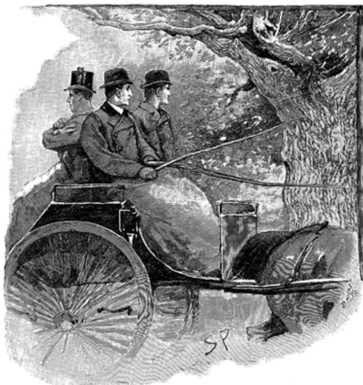
"IT HAS A GIRTH OF TWENTY-THREE FEET."

"I was already firmly convinced, Watson, that there were not three separate mysteries here, but one only, and that if I could read the Musgrave Ritual aright, I should hold in my hand the clue which would lead me to the truth concerning both the butler Brunton and the maid Howells. To that, then, I turned all my energies. Why should this servant be so anxious to master this old