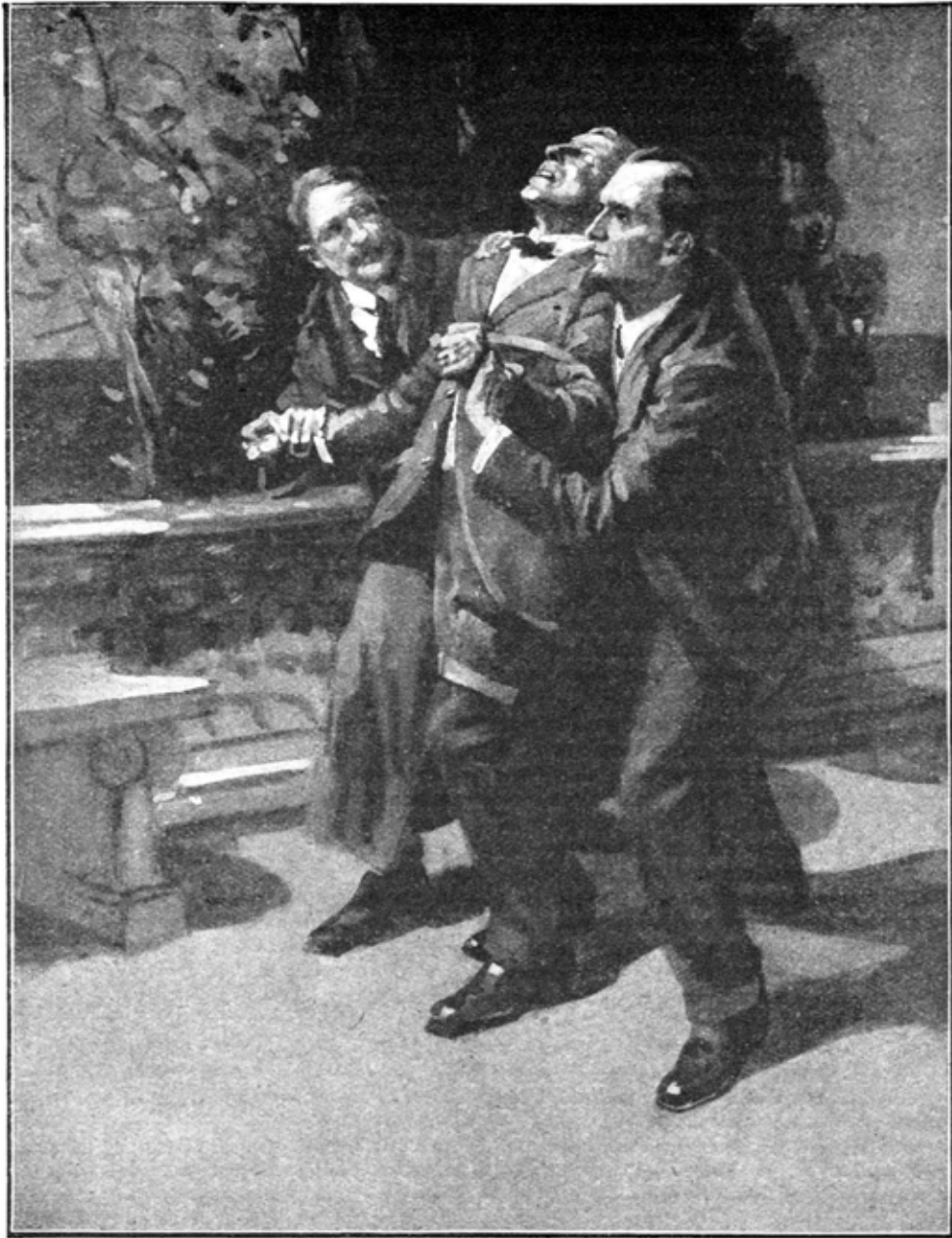
"HOLDING EITHER ARM, THE TWO FRIENDS WALKED HIM VERY SLOWLY DOWN THE GARDEN PATH."

no existence in fact. He was a concoction, a myth, an isolated strand from my bundle of personalities. I used him and he is gone."