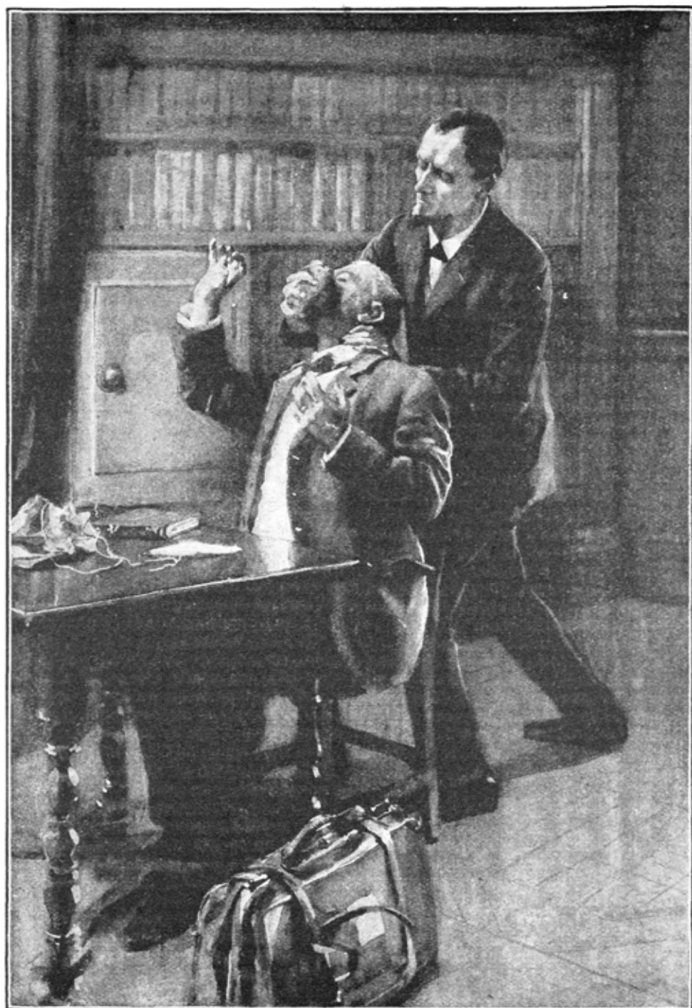
"HE WAS GRIPPED AT THE BACK OF HIS NECK BY A GRASP OF IRON, AND A CHLOROFORMED SPONGE WAS HELD IN FRONT OF HIS WRITHING FACE."