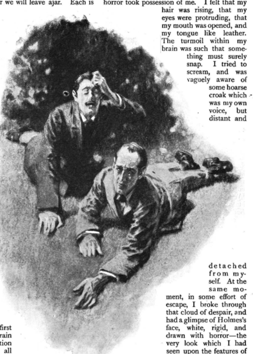
"WE LURCHED THROUGH THE DOOR, AND AN INSTANT AFTERWARDS HAD THROWN OURSELVES DOWN UPON THE GRASS PLOT."