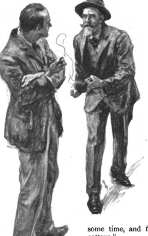
"HE SPRANG FORWARD WITH CLENCHED HANDS TOWARDS MY COMPANION."

"You then walked swiftly for the mile which separated you from the vicarage. You were wearing, I may remark, the same pair of ribbed tennis shoes which are at the present moment upon your feet. At the vicarage you passed through the orchard and the side hedge, coming out under the