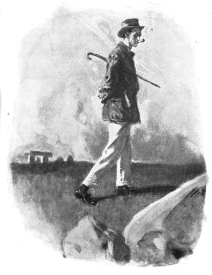
"HOLMES SPENT MUCH OF HIS TIME IN LONG WALKS AND SOLITARY MEDITATIONS."

The glamour and mystery of the place, with its sinister atmosphere of forgotten nations, appealed to the imagination of my friend, and he spent much of his time in long walks and solitary meditations upon the moor. The ancient Cornish language had also arrested his attention, and he had, I remember, conceived the idea that it was akin to the Chaldean, and had been largely derived from the Phœnician traders in tin. He had received a consignment of books upon philology and was settling down to develop this thesis, when suddenly to my sorrow, and to his unfeigned delight, we found ourselves, even in that land of dreams, plunged into a problem at our very doors which was more intense, more engrossing, and infinitely more mysterious than any of those which had driven us from London. Our simple life and peaceful, healthy routine were violently interrupted, and we were precipitated into the midst of a series of events which caused the utmost excitement not only in Cornwall,